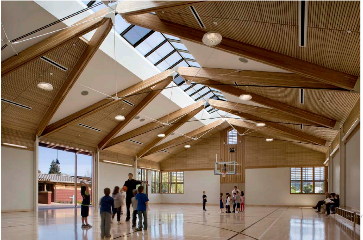
> Multi-purpose Room above and below