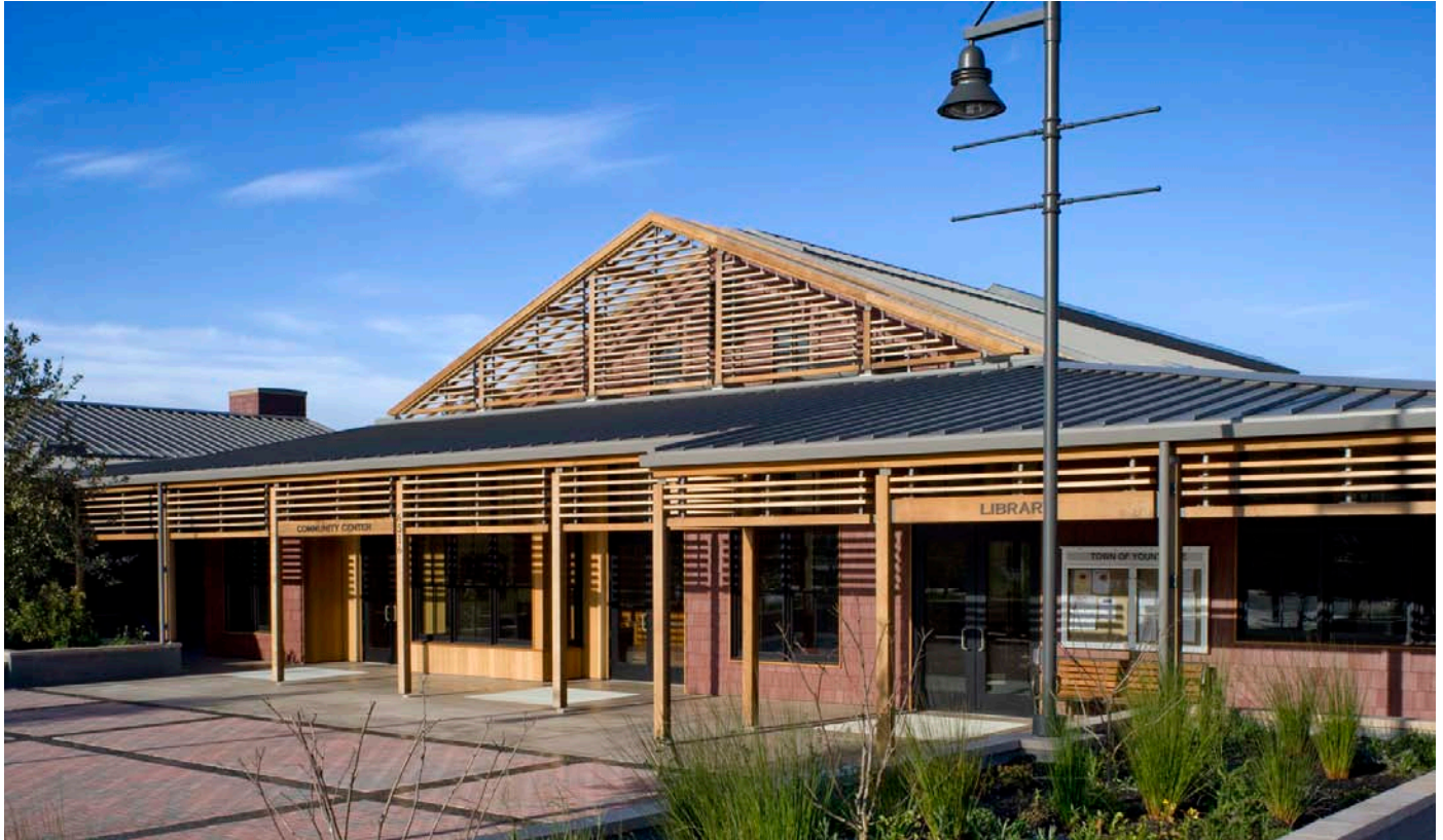
^ New Community Center and Library