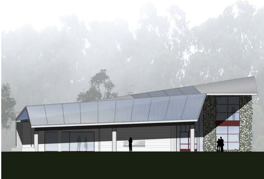
^ Education Building – North Elevation