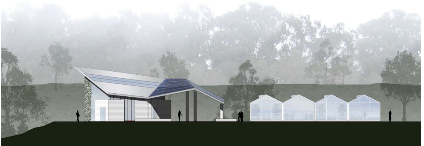
^ Education Building – East Elevation