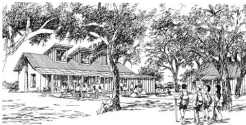
▲ Dining Hall